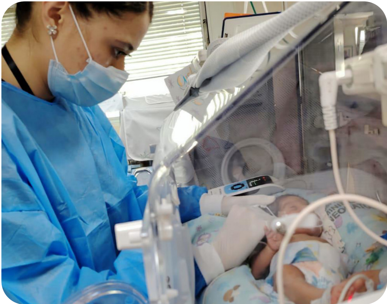
Early hearing screening is vital for NICU newborns, where premature birth heightens the risk of hearing loss. In Guatemala, our partners are collaborating with the Ministry of Health to strengthen early detection.

The early identification of children with hearing loss requires more than clinical expertise. It depends on strong public health systems and policies that prioritize screening and early intervention. In many countries, however, neonatal hearing screening remains limited to pilot initiatives.