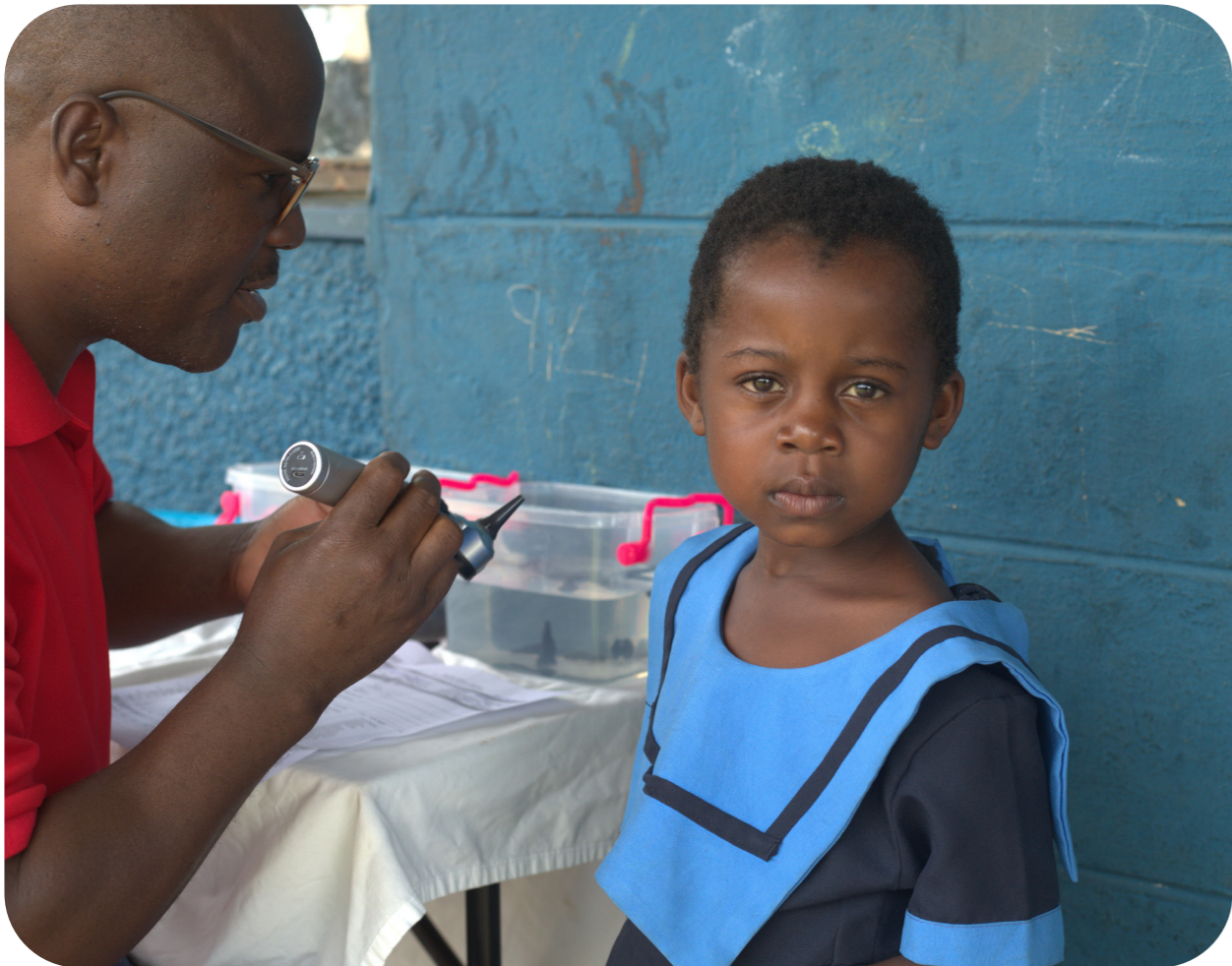
A young girl prepares to receive an otoscopy at a school screening as part of CBM's work to embed hearing care into local communities.

In many communities, the first step toward addressing hearing loss is to give families access to reliable information. When caregivers, teachers, and community leaders understand the signs of hearing loss and the importance of early intervention, children are far more likely to receive the support they need.