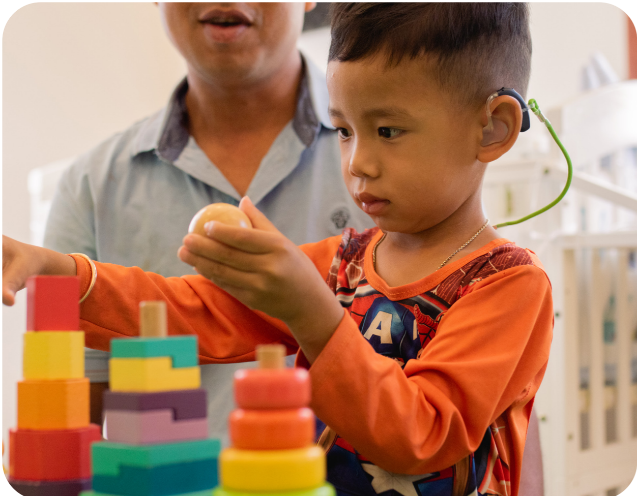
A boy with hearing aids engages in play-based therapy in Cambodia, where hands-on activities help children develop vital communication skills.

Access to hearing care is essential for children with hearing loss. For more than 16 years, Hear the World Foundation partnered with All Ears Cambodia (AEC) to expand access to audiological care and strengthen hearing health services for children and families.