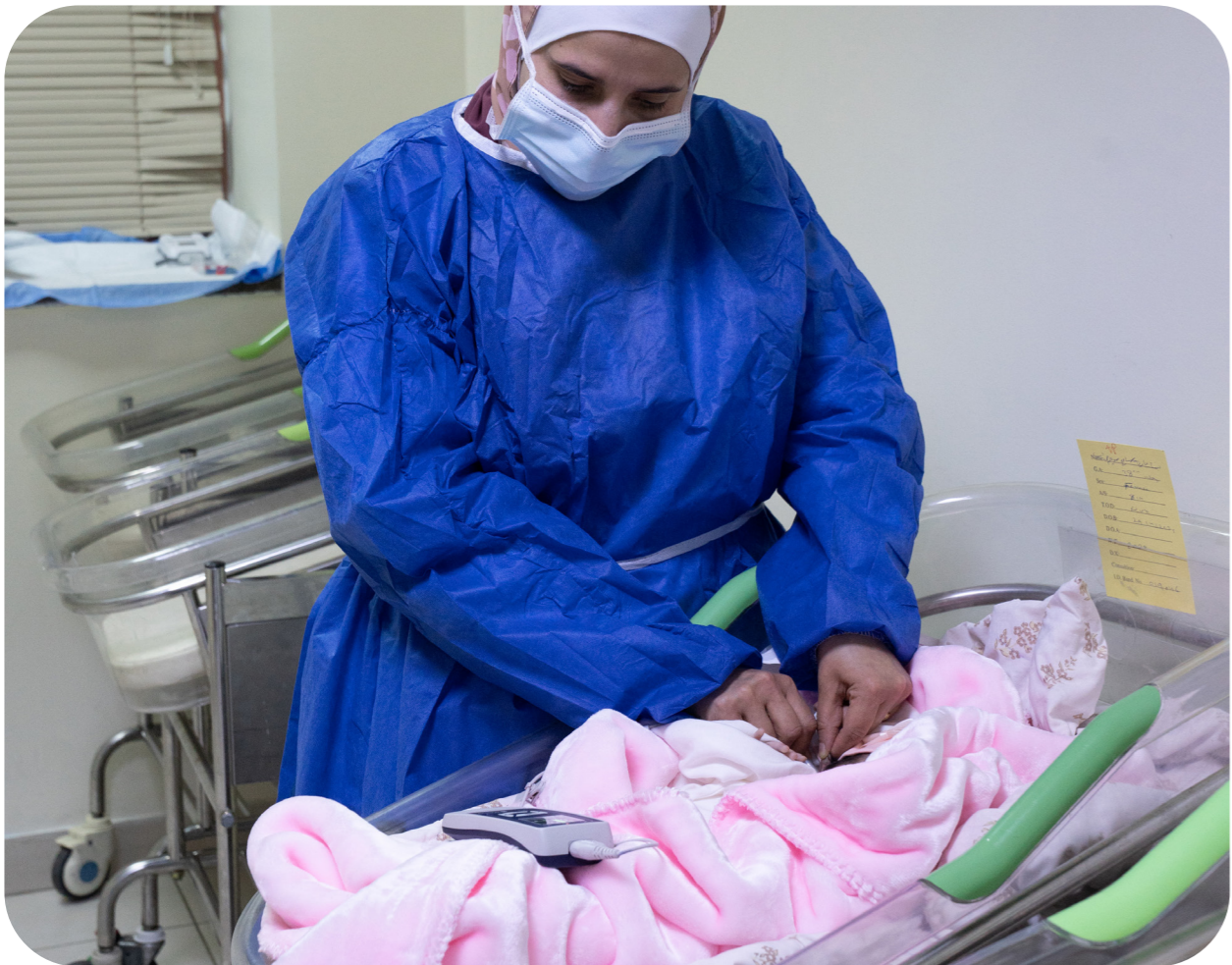
A newborn is screened through Jordan University Hospital’s Hearing Joy Project, an initiative driving nationwide newborn and pediatric hearing care.